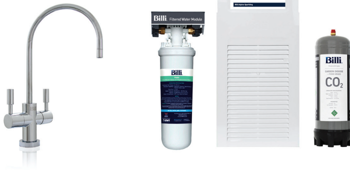
Alpine Sparkling Under-Bench Unit