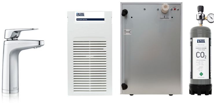
Quadra Sparkling Under-Bench Unit